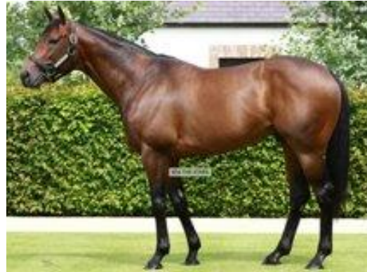
Sea the Stars